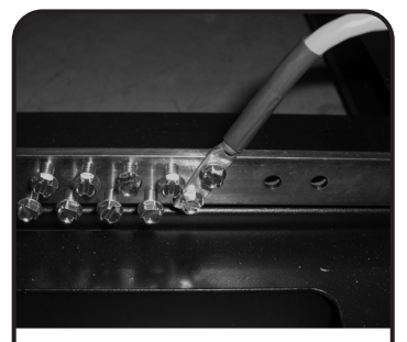
Remove any oxidation, etc. from the mounting surfaces with abrasive pad and apply a coating of antioxidant material. Using (2) of the 12-24 x 1/2" machine screws attach one end of the 96" ground wire to the ground bar.