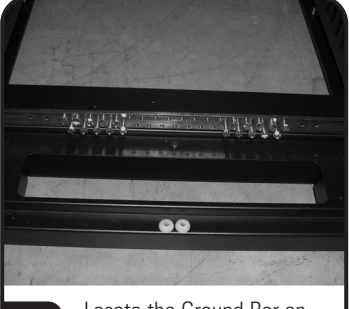
Locate the Ground Bar on the cabinet (the ground bar can be mounted on either the top or the bottom).

Flat Head Screw Driver 5/16" Nut Driver Compression tool w/correct dies (if optional commpression tap utilized)