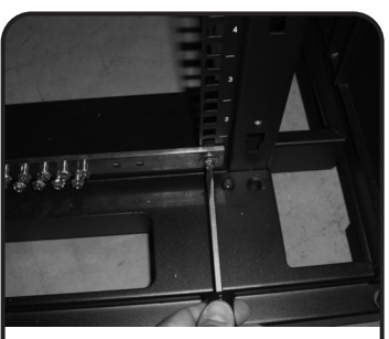
Using the (2) 12-24 x 5/8" thread forming screws, attach the ground bar to the cabinet.