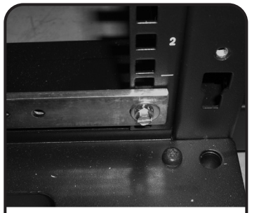
Remove all paint, etc. from mounting surface of cabinet. Remove any oxidation, etc. from back side of the ground bar at the point of attachment to the cabinet using the abrasive cleaning pad. Apply a coating of antioxidant material to the mounting surfaces.