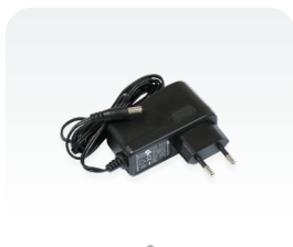
24 V 0.38 A power adapter