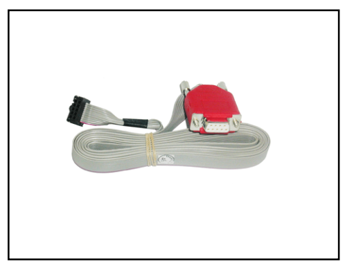
X187 Programming Cable