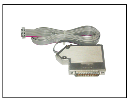
FN-P187 Printer Interface Cable