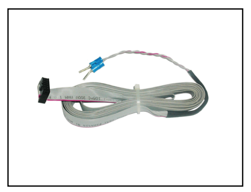
FN-V187 VoiceNET Serial Interface Cable