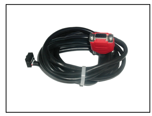
S187 Programming Cable