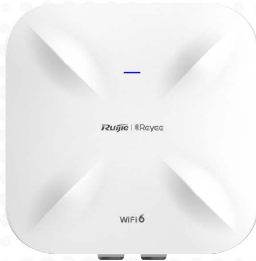
Figure 1-1 RG-RAP6260(G)