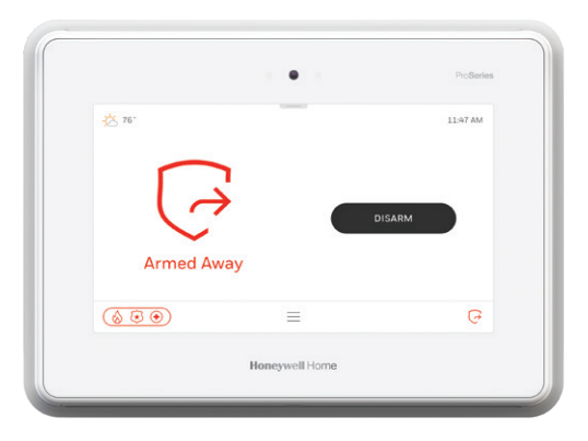
7" AIO Security Panel: PROA7PLUS