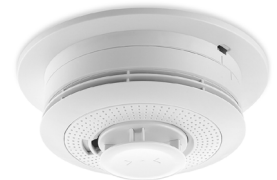
COVERPLATE shown with PROSIXSMOKEV