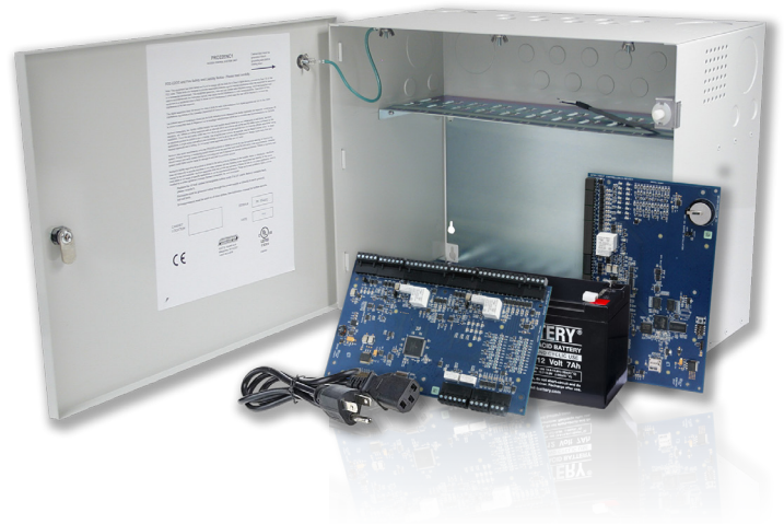
PW7000-Series Access Control System.

The PW7K1IC comes with 2 on-board reader ports that support multiple reader communication protocols including Wiegand and OSDP (V2) Secure Channel Protocol (SCP). OSDP SCP is now supported across all the intelligent controller and reader board hardware. PW7000-series control panels and I/O boards are backwards compatible with PW6000-Series*.