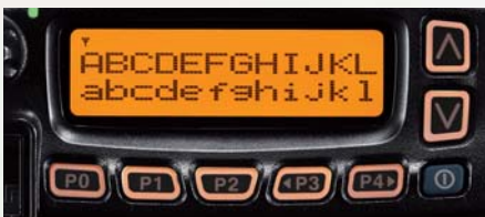
Two line setting display example.

With a high contrast dot matrix display, upper and lower case characters can be easily distinguished. You can change the display setting to show one line and 12 characters, or two lines and 24 characters via programming. LCD backlighting is standard.