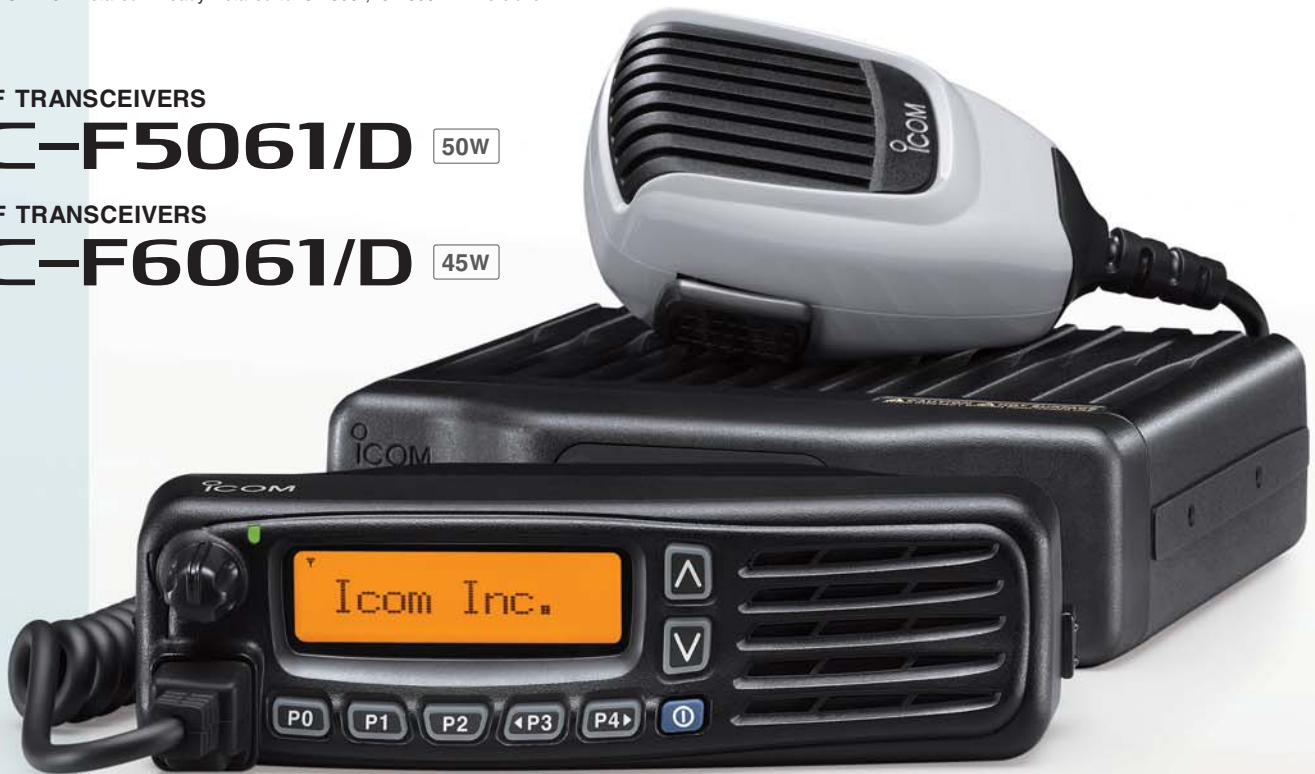
The above photo includes optional separation kit, RMK-3, and separation cable, OPC-609.