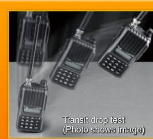
Transit drop test (Photo shows image)