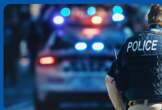
POLICE FLEET MANAGEMENT