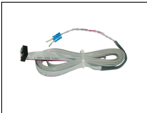
FN-V187 VoiceNET Serial Interface Cable