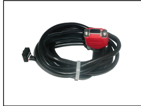
S187 Programming Cable