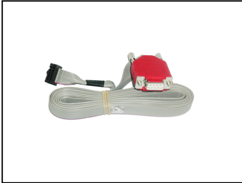
X187 Programming Cable