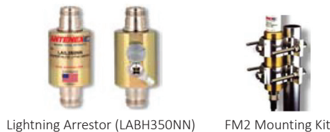
Lightning Arrestor (LABH350NN)