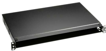
Opticom® Rack Mount Fiber Trays