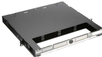
Opticom® Rack Mount Fiber Enclosures