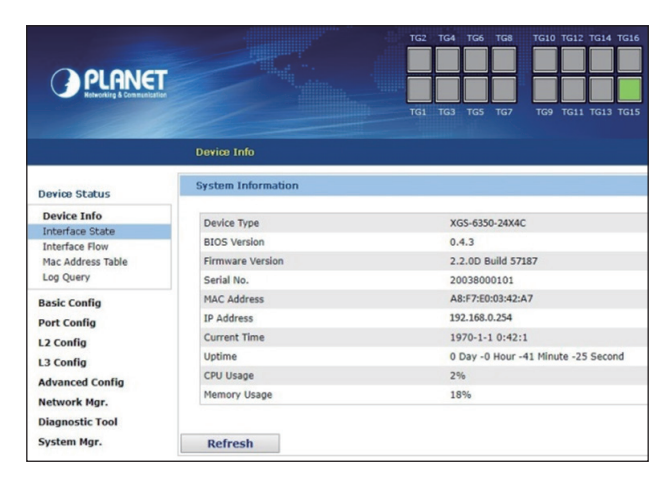
Figure 5-3 Web Main Screen of Managed Switch

3. After entering the password, the main screen appears as shown in Figure 5-3.