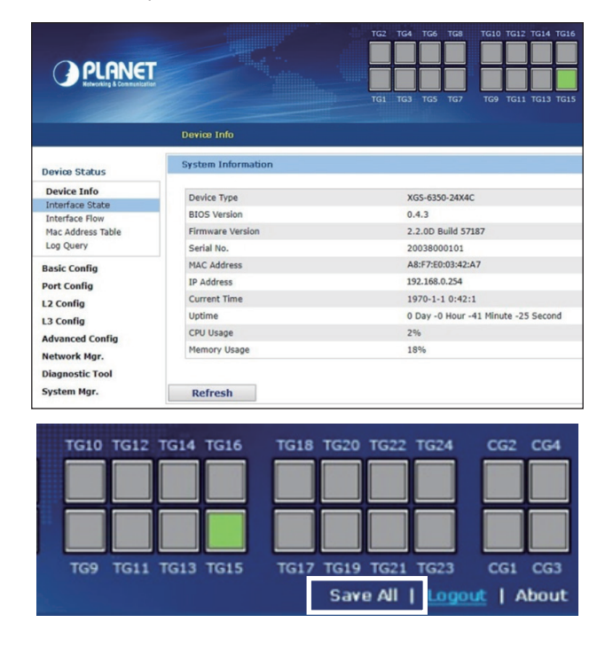
Figure 5-4 Save Cconfiguration

To save the configuration, you have to click "Save All " on the top control bar. "Save All " function is equivalent to the execution of the write command.