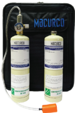
*Gas Sold Separately*

The Macurco 6 & 12 Series detection family requires routine testing and calibration. Each detector has a corresponding testing/calibration kit to test and calibrate the detectors in the field. Sensors may drift over time, so it is recommended to have a maintenance plan to ensure detectors responding to gas appropriately. A gas calibration is the process of exposing a sensor to a target gas at a specific concentration and then adjusting the gas detector to read that gas concentration properly. Macurco recommends testing and calibration at a least once per year at a minimum but depending on the application and risk potential of the application a greater frequency might be needed. Check with local authorities for any specific local regulations.