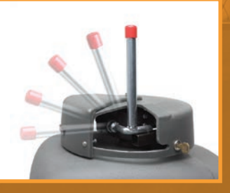
Easy to Operate manual release