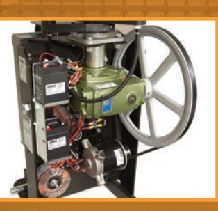
Steel Frame for strength and durability