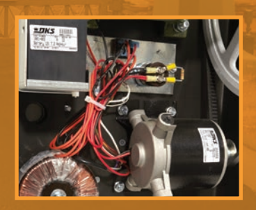
DC Motor & Battery Backup for continued gate operation if AC power is lost access to all internal parts

Gate Tracker<sup>™</sup> record users access