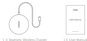
1 × Magnetic Wireless Charger 1 × User Manual

DE: Lieferumfang | FR: Contenu de l'Emballage | ES: Contenidos del Paquete | IT: Contenuto del Pacco | RU: В упаковке JP: パッケージ内容 | CN: 包装清单 | AR: محتويات الحزمة | NL: Package Contents | SE: Innehåll i pakete | PL: Zawartość opakowania TR: Paket İçeriği | PT: Conteúdo da Embalagem