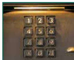
lighted keypad and display