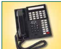
dtmf tone output useable with PBX, KSU and telephone systems with auto-attendants