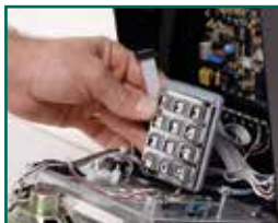
modular design makes installation and service easy