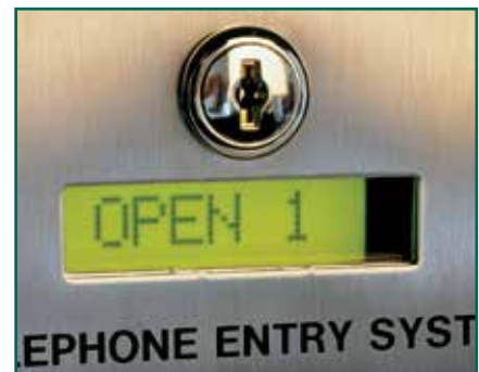
built-in display indicates door/gate has been opened