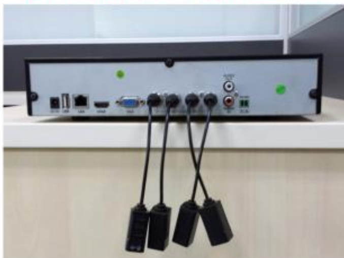
Old baluns make the cabinet a mess