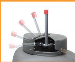
Easy to Operate manual release