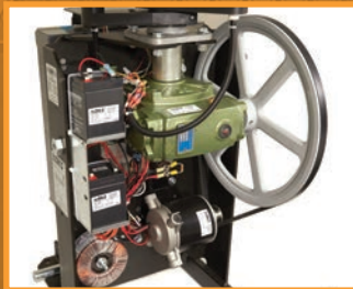
Steel Frame for strength and durability