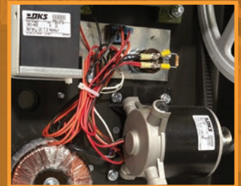
DC Motor & Battery Backup for continued gate operation if AC power is lost access to all internal parts