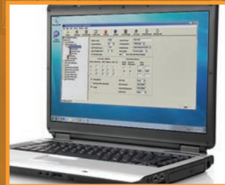
Gate Tracker™ record users access