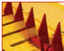
spikes available in 3 foot sections