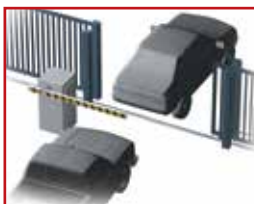
automatic sequencing when used in conjunction with slide or swing gate operators