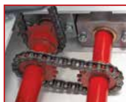
transfer box provides direct mechanical linkage