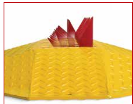
surface mount spikes install easily without trenching and double as a speed bump